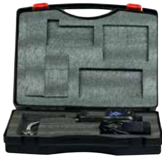
FG-3000R with Accessories in Included Carrying Case