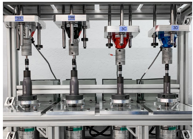
Mountz C mk precision, accuracy, and lifecycle testing station.