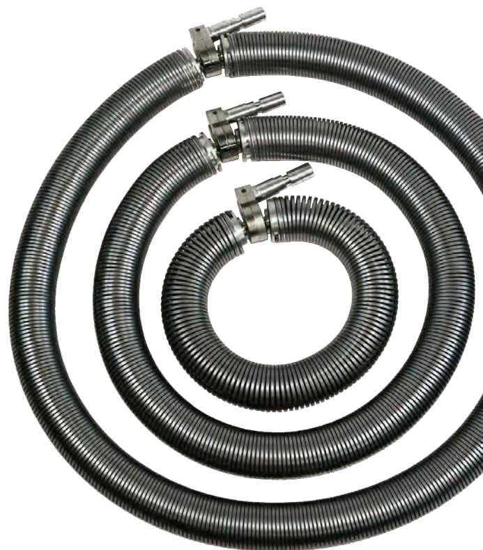
Rolling Spring Electrodes