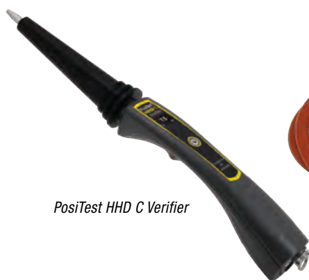
PosiTest HHD C Verifier