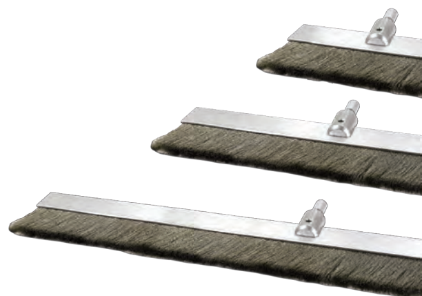
Flat Wire Brush Electrodes

Use spring and brush electrodes made by other manufacturers with DeFelsko adaptors: