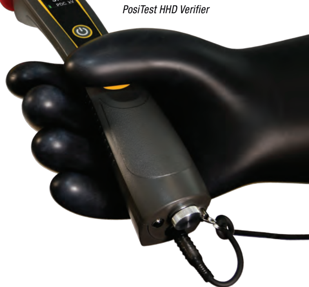
PosiTest HHD Verifier