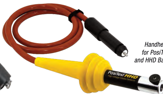
Handheld Wand for PosiTest HHD and HHD Basic only