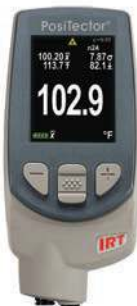
Scanning Statistics Mode