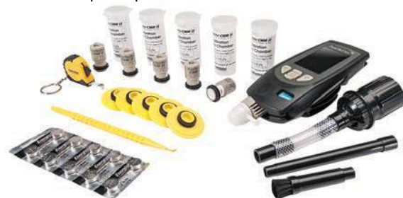
PosiTector CMM IS Pro Kit includes the PosiTector DPM Advanced

Replacement chambers, salt solutions, tools, caps and fins are available upon request