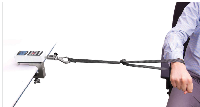
Force gauge shown in a horizontal orientation