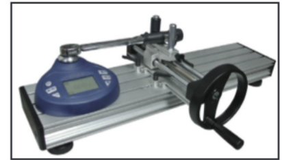
Testing TTC with Internal Sensor