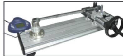
Testing TTC with External Sensor