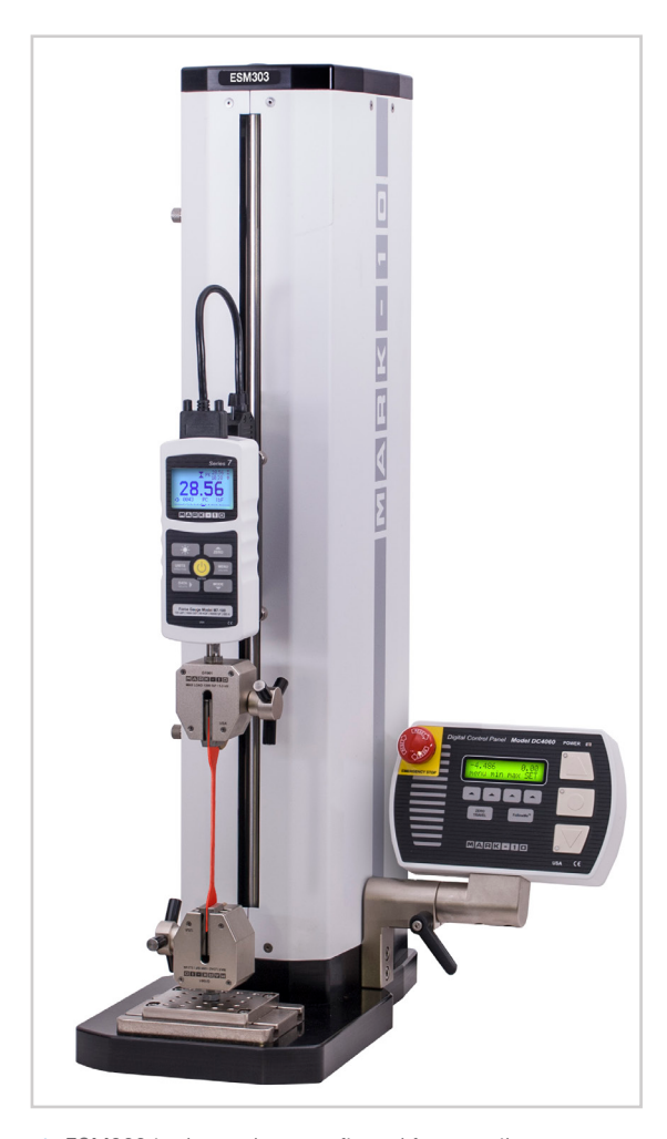
ESM303 is shown above configured for a tensile test, with a Series 7 force gauge and G1061-2 wedge grips.