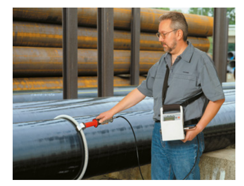
Porosity detection on pipelines

Non-destructive porosity detection requires adapted high voltages covering different ranges. The versatile Poro-Test 7 offers 2 types of high voltage probes, which are interchangeable with the control unit. The test electrode of your selection directly plugs to the high voltage probe. The specific high voltage setting is entered on the control unit's touch pad and is displayed on the digital display and monitored via the electronic control. The PoroTest 7 is designed for safe use, the high voltage probes are designed and engineered to be insulated and absolutely risk free to the operator. Electrical safety conforms to the German standard VDE 0411, part 1: Both, the maximum discharge rate as well as the probe voltage never exceed the limit values as set forth in the safety standard.