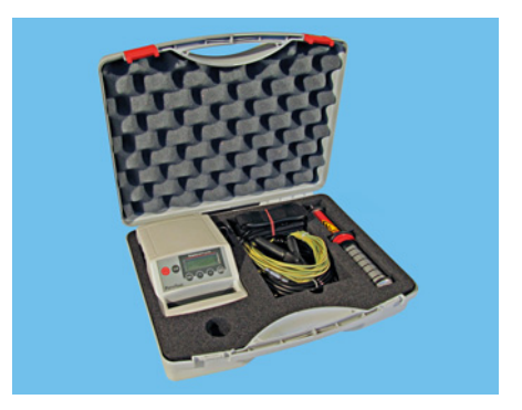
Plastic carrying case with standard accessories

The PoroTest 7 is a powerful tool for porosity detection and includes the following items: