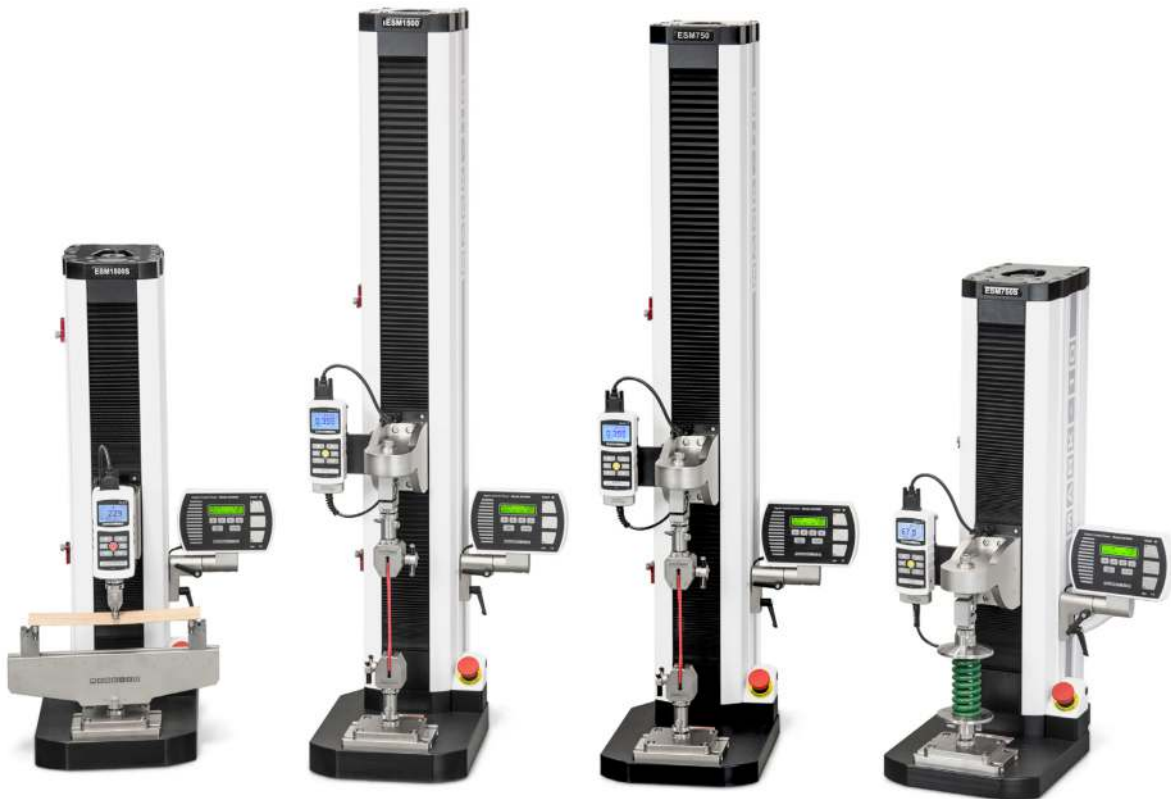
ESM1500S 1,500 lbF [6.7 kN] 14.2 in [360 mm] travel