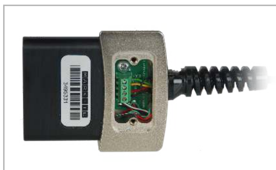
^ Cover is removed to expose the PCB with labelled wire connections and screw terminal block.