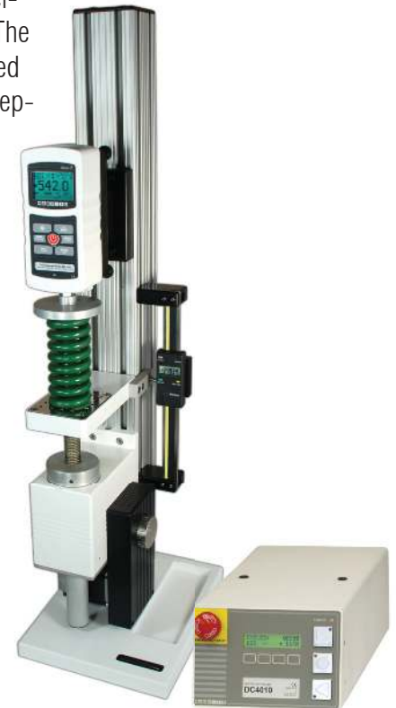
The TSFM500-DC is shown in a typical spring testing application, with Model M5-1000 digital force gauge and compression plate.