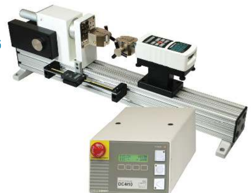
The TSFM500H-DC is shown set up for a tensile test, with Model M5-1000 digital force gauge and wedge grips.

Bi-directional communication with a PC for computer control. Also sends force data from the controller to a PC.