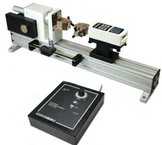
The TSFM500H is shown set up for a tensile test, with Model M5-1000 digital force gauge and wedge grips.