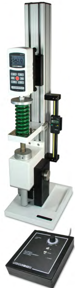
The TSFM500 is shown in a typical spring testing application, with Model M5-1000 digital force gauge and compression plate.