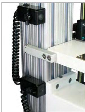
^ Included set of adjustable limit switches