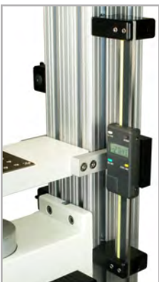
^ Optional digital travel display