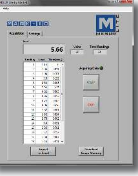
^ MESUR Lite data acquisition software is included with Series TT03C gauges

The gauges include MESUR<sup>™</sup> Lite data acquisition software, for tabulation of continuous or individual data points. One-click export to Excel button easily allows for further data manipulation.