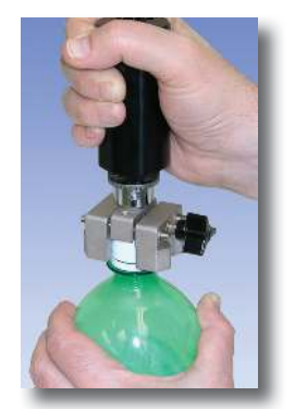
Universal cap grip and ergonomic sensor design makes testing a breeze