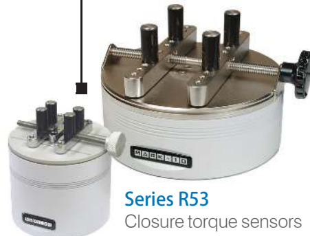
Series R53 Closure torque sensors