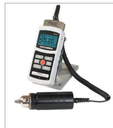
5i is shown mounted to an optional AC1008 tabletop stand with Series R50 torque sensor

The 5i includes MESUR™ Lite data acquisition software. MESUR™ Lite tabulates continuous or single point data. Data saved in the indicator's memory can also be downloaded in bulk. One-click export to Excel easily allows for further data manipulation.