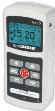
Model 5i Advanced Indicator