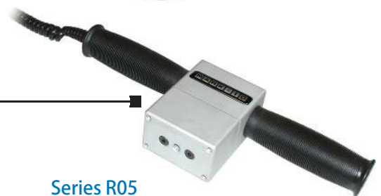
Series R05 Ergonomics testing push / pull sensors