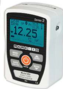
Model 3i Basic Indicator