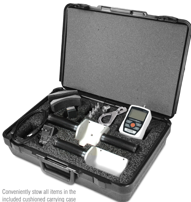
Conveniently stow all items in the included cushioned carrying case

Cushioned carrying case, AC adapter, battery, user's manual, and NIST-traceable certificate of calibration.