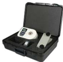
Optional carrying case