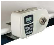
Optional bench mounting bracket