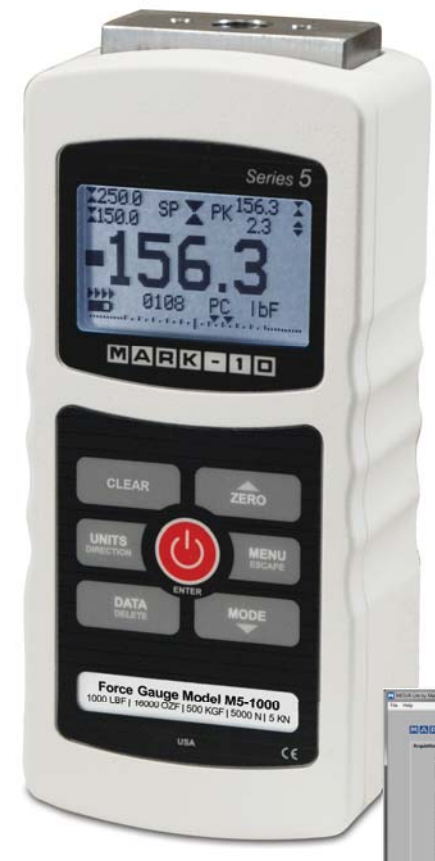
MESUR™ Lite data acquisition software is included with the gauges

The M5-750, M5-1000, M5-1500, and M5-2000 advanced digital force gauges are designed for tension and compression force testing in numerous applications across virtually every industry, with capacities up to 2,000 lbF (10,000 N). The gauges features an industry-leading sampling rate of 7,000 Hz, producing accurate results even for quick-action tests. Accuracy is \pm 0.1\% of full scale \pm 1 digit, and resolution is 1/5,000. A large, backlit graphics LCD displays large, legible characters, while the simple menu navigation allows for quick access to the gauges' many features and configurable parameters. Data can be transferred via USB, RS-232, Mitutoyo (Digimatic), or analog outputs.