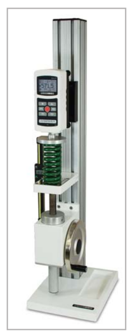
Shown with a TSF test stand in a spring testing application

sophisticated testing requirements. The force gauges are directly compatible with high capacity Mark-10 test stands, grips, and software.