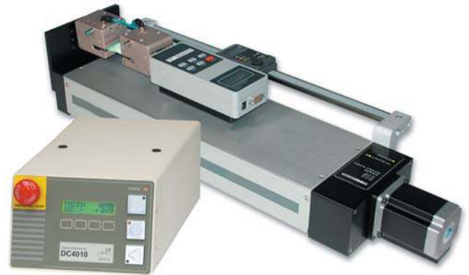
The ESMH-DC is shown in a peel testing application, with Series BG digital force gauge, digital travel display, and pneumatic film & paper grips

The ESMH-DC's controller adds a significant amount of sophistication, including an extended speed range, PC control capability, programmable cycling, auto return, overload protection, and other features.