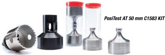
PosiTest AT 50 mm C1583 KIT

Convert your adhesion tester to a different model with our choice of Conversion Kits. Choose from 20 mm, 50 mm, 50 x 50 mm Tile, and 50 mm C1583 kits. Kits include the appropriate stand-off, holesaw (if applicable), and test dollies.