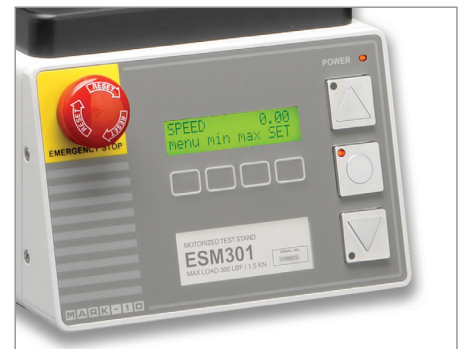
^ Digital controller features a backlit LCD screen with menu choices for ease of setup and operation