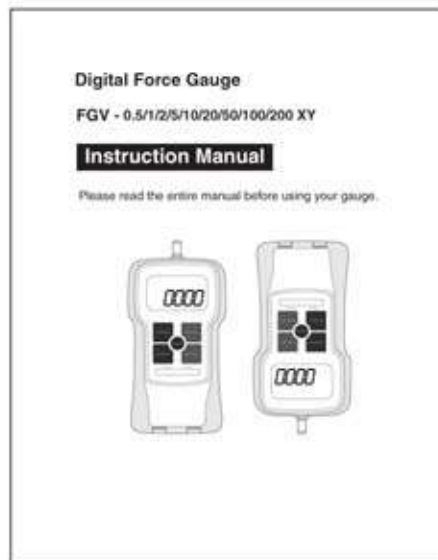
FGV-XY 2.0 Manual