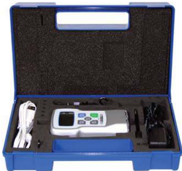
FGV-XY 2.0 Kit with Standard Accessories