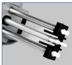
ETMPB with non-rotating ceramic pins