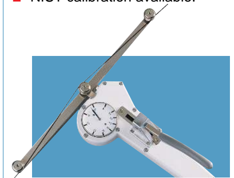
Model DXL-5K with 250 mm spacing between outer rollers.