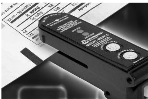
Dark Mark on a Light Web (Figure A)