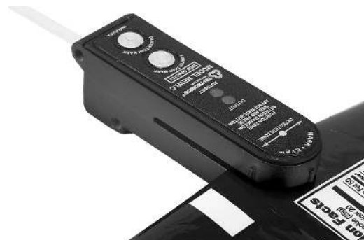
Light Mark on a Dark Web (Figure B)