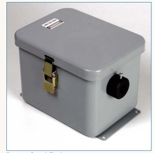
Drawn Steel Enclosure