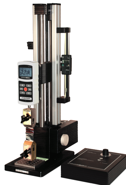
The ESM is shown in a typical tensile testing application, with Series 5 digital force gauge, digital travel display, limit switch kit, and wedge grips