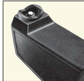
Carbide measuring probe for long life.

FOR: Hot dip galvanizing, hard chrome metalizing, paint, enamel coatings on steel