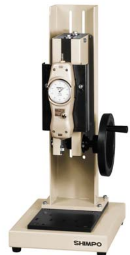
MF with FGS-100H Manually Operated Test Stand (sold separately)