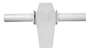
Optional MFP-Handle Ideal for Heavy Loads