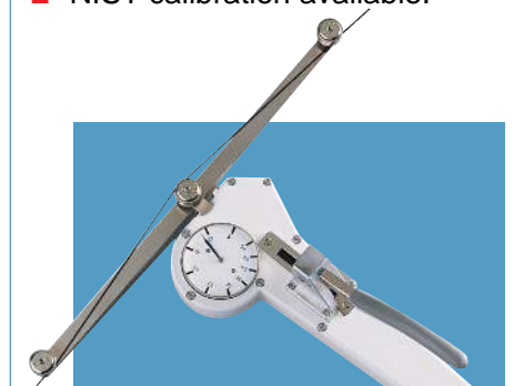
Model DXL-5K with 250 mm spacing between outer rollers.