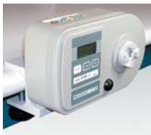
Optional bench mounting bracket