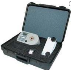
Optional carrying case

Series ST Torque Tool Testers present a simple, yet accurate solution for testing hand operated torque screwdrivers, wrenches, and other tools. Applications exist in manufacturing facilities in virtually every industry. The ST features a solid aluminum housing, making it rugged enough for many years of service in production or laboratory use, while a universal receptacle accepts common bits and attachments. The ST captures peak torque in both clockwise and counterclockwise directions.